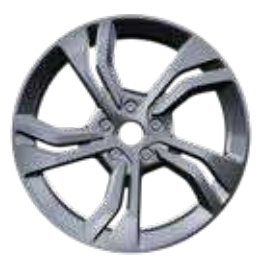
Ambiente & Trend: 18" Alloy Wheel