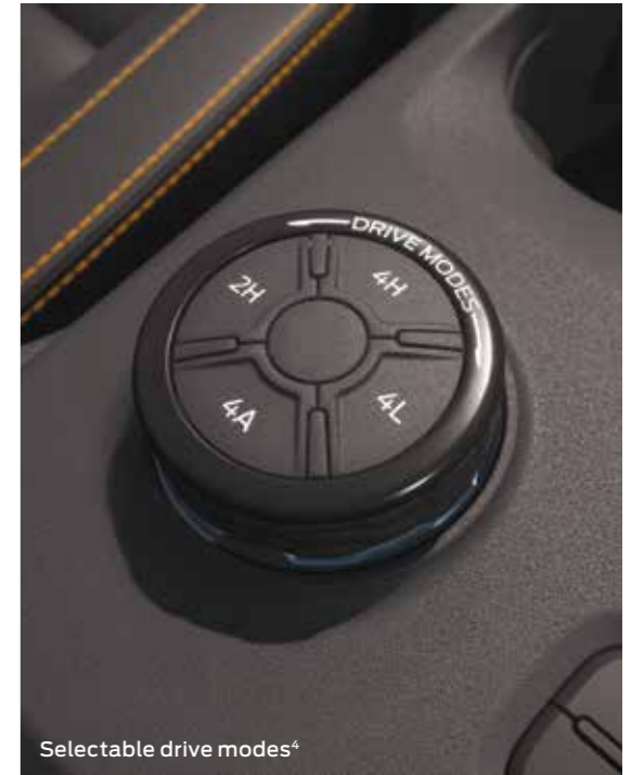
Selectable drive modes 4