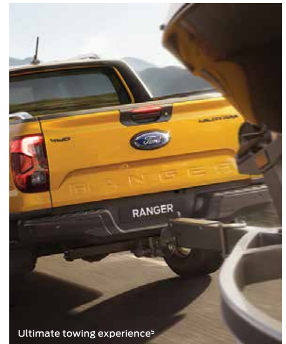
Ultimate towing experience 5