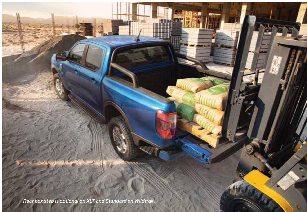
Rear box step is optional on XLT and Standard on Wildtrak.

On selected models, a network of lights including headlamps, external mirror puddle lamps and rear box lamps work together to illuminate the perimeter of the vehicle so you can work or play into the night.