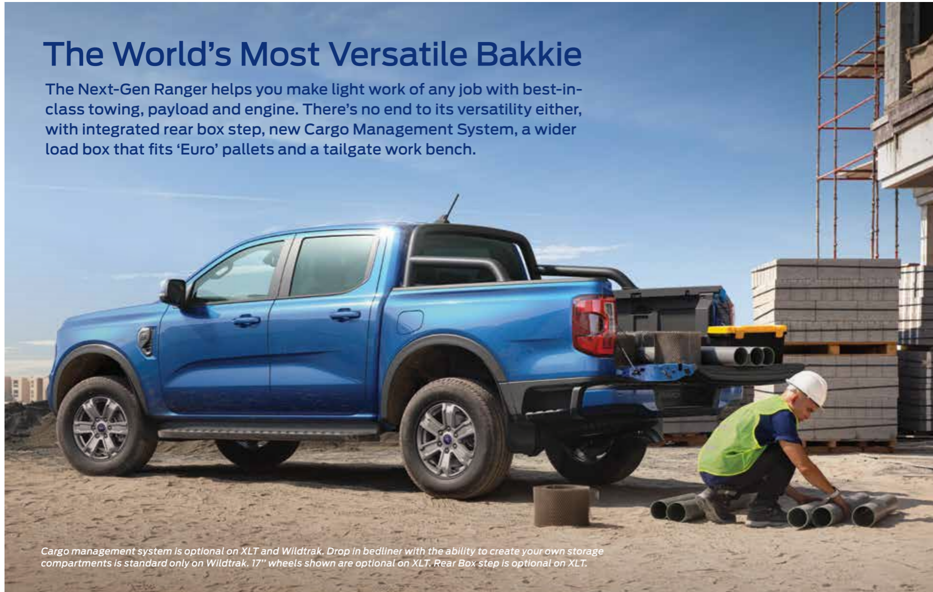
Cargo management system is optional on XLT and Wildtrak. Drop in bedliner with the ability to create your own storage compartments is standard only on Wildtrak. 17" wheels shown are optional on XLT. Rear Box step is optional on XLT.

The Next-Gen Ranger helps you make light work of any job with best-in-class towing, payload and engine. There's no end to its versatility either, with integrated rear box step, new Cargo Management System, a wider load box that fits 'Euro' pallets and a tailgate work bench.