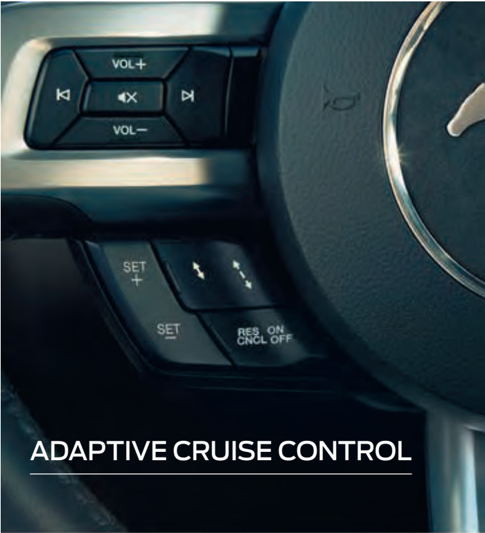
ADAPTIVE CRUISE CONTROL