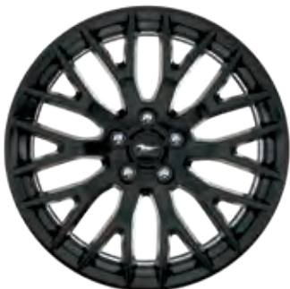
19"x9" (F) 19"x9.5" (R) Ebony Black-painted Aluminium (Standard on 5.0L V8)