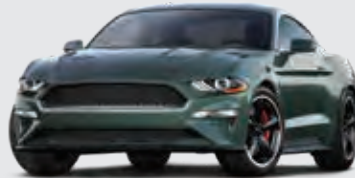
Dark Highland Green

10 minutes and 53 seconds. That's all it took for the New MUSTANG to drive into cinematic history and become an icon for generations to come. 50 years after what critics call one of the best car chase scenes of all time, the legend is back. In all its glory, power and prestige, the 50th anniversary edition MUSTANG BULLITT is here.