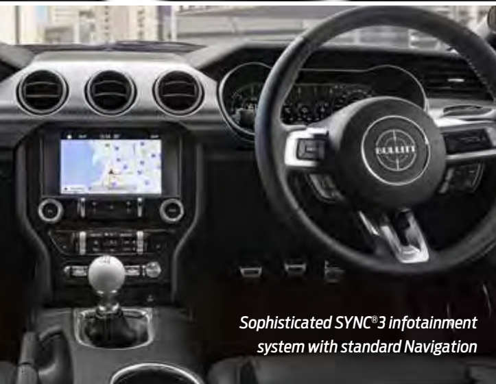
Sophisticated SYNC 3 infotainment system with standard Navigation