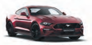
Ruby Red (Metallic)