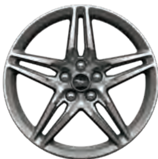
19"x9" Luster Nickel-painted Forged Aluminium (Optional on 2.3L and 5.0L V8)