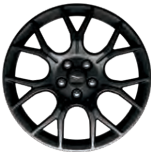
19"x9" Low-gloss Ebony Black-painted Aluminium (Standard on 2.3L)