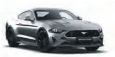
Ingot Silver (Metallic)