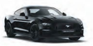
Shadow Black (Metallic)