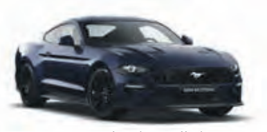
Kona Blue (Metallic)