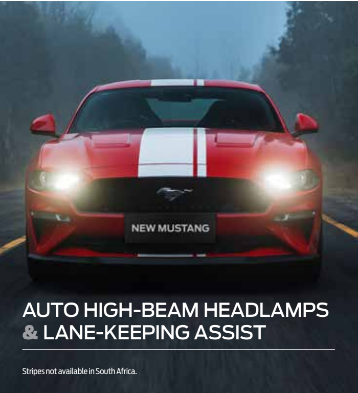
AUTO HIGH-BEAM HEADLAMPS & LANE-KEEPING ASSIST