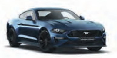
Velocity Blue (Metallic)