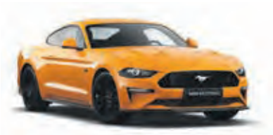
Orange Fury (Metallic)